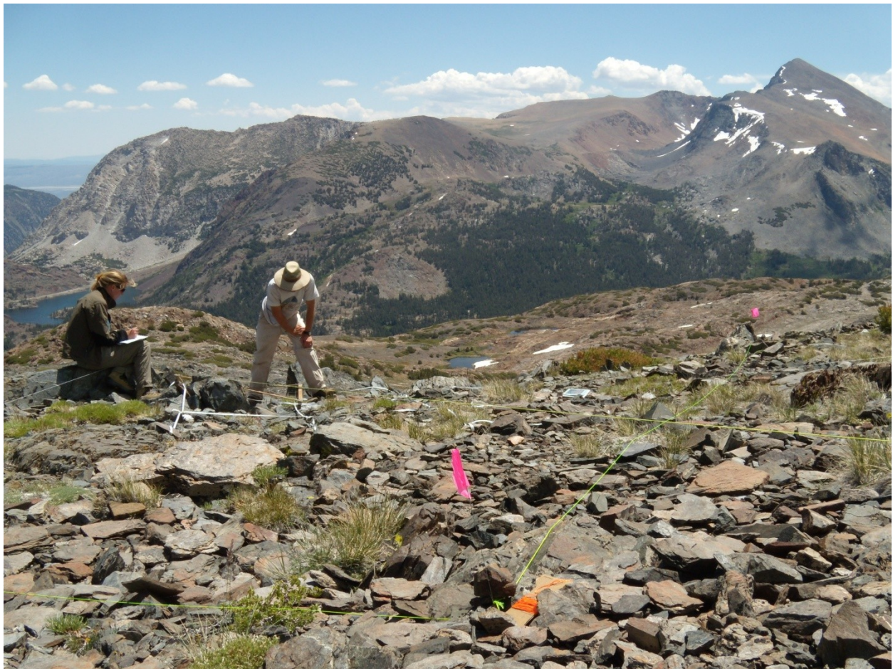
Figure 2. GLORIA monitoring plots on a ridge near Mt. Dana and Tioga Pass. The Gaylor Lake & ridge hike (Day 2) lies nearby.